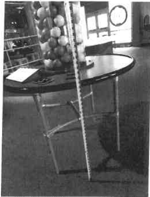
Figure 20 - Cylinder Exhibit Table not Cane Detectable in Science Phenomena Exhibit Area

Note - The steps at the "Bridge of Fire" exhibit (see Figure 22) and the large coiling pipe display used to demonstrate sound across space are both inaccessible, but are unique educational displays for which the modification for accessibility would "fundamentally alter" the nature of the scientific experience and Section 504 regulations allow for such exceptions, therefore these displays may remain unchanged provided that alternative information (e.g. a video or other demonstration) is provided in an accessible location.