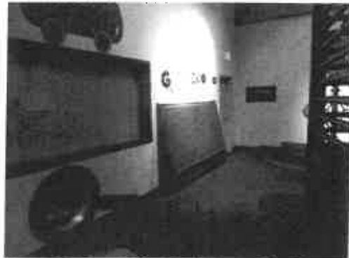
Figure 24 - Curved Wooden Platforms Block Access to Exit Doors in Polymer Funhouse Area