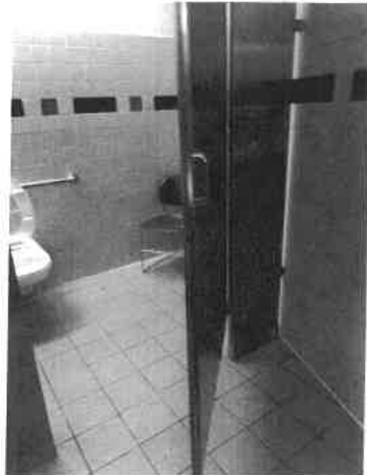
Figure 33 - Stall Door Not Diagonally Opposite Toilet Due to Angled Omnimax Wall