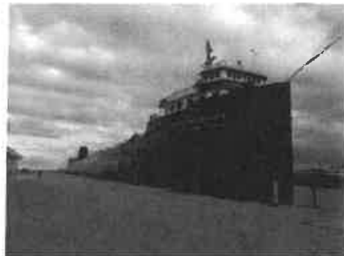
Figure 34 - Limited Accessibility Provided at the Steamship William G. Mather

The unique quality of a museum within an antique steamship (see Figure 34 ) makes the matter of accessibility at this facility very challenging. While access is limited to one main display area and the service counter located up a ramp from the adjacent dock, there is little else that can be done to physically improve the accessibility of this ship. The Center operates guided and self-guided tours of the steamship during temperate months. 94 In addition, they also provide seating on the deck of the ship for air shows and fireworks displays.