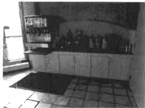
Figure 11 - Shelf Below Soda Dispenser is not Cane Detectable