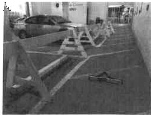
Figure 6 - Wood Barricades Block Access Aisles