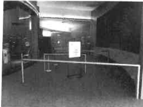
Figure 15 - Leaning Rails and Stanchions are not Cane Detectable