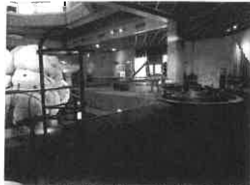
Figure 19 - Cloud Rings Rim and Confused Sea Rim not Cane Detectable in Science Phenomena Exhibit Area