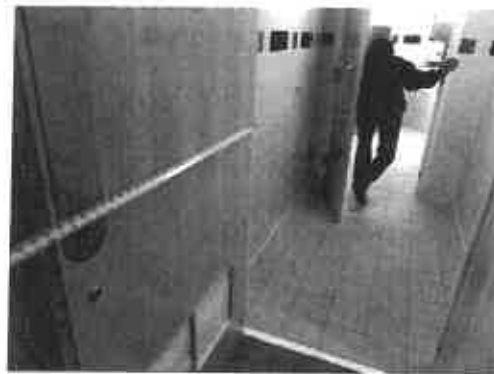
Figure 30 - Interior Vestibule Door Lacks 18" Pull Side Clearance at Women's Restroom in Administration Suite