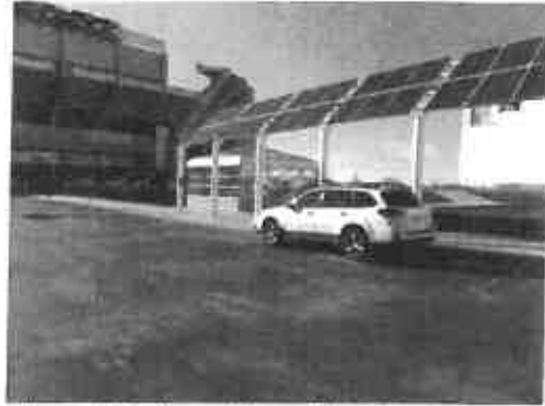
Figure 1 - Designated Accessible Parking in Drop-Off Driveway

Additionally, the concrete approach walk which extends from the back end of the designated accessible parallel parking space closest to the front entrance to the solar panel support post closest to the front entrance has an inaccessible cross slope exceeding (at up to 3.3%) the maximum 2% allowed under UFAS 4.3.7 (see Figure 2 ).