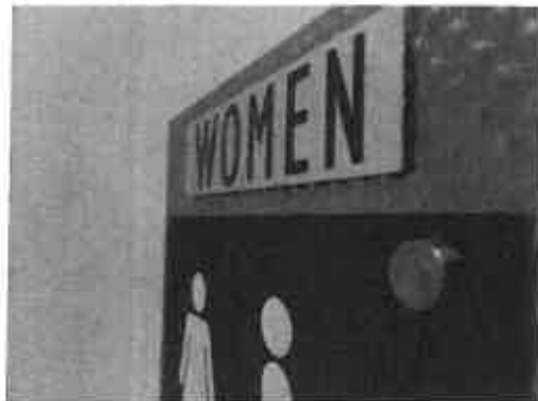
Figure 28 - Typical Restroom Signs Lack Raised Letters as Required by UFAS