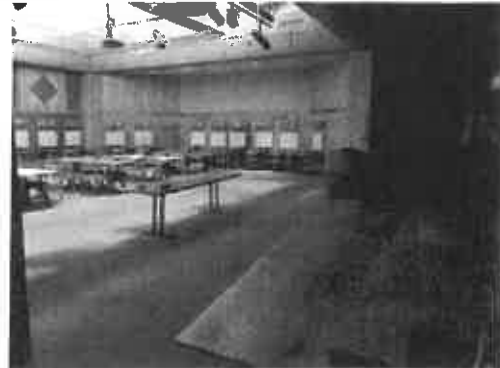
Figure 8 - Inaccessible Ramp at Reinberger Auditorium Stage

2. Reinberger Auditorium - The ramp at the stage lacks edge protection, has a 1/2" high un-beveled lip at the bottom and is steeper (at 12.3%) than the maximum allowable running slope of 8.3% per UFAS 4.8 (see Figure 8 ). Additionally, there is no assisted listening system (UFAS 4.1.2(18)(b)) for this assembly area with an audio amplification system.