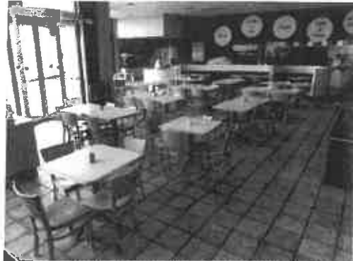
Figure 10 - Inadequate Accessible Tables in Cafe