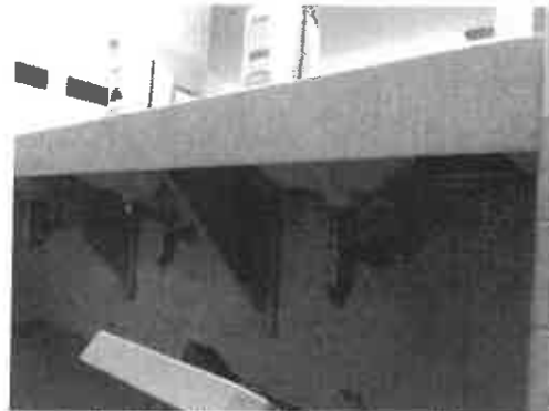
Figure 31 - Typical Hot Water and Drain Pipes without Insulation (Men's Room on Main Level Exhibits Area)