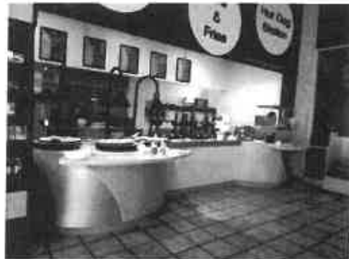
Figure 12 - Lowered Counters Not Cane Detectable