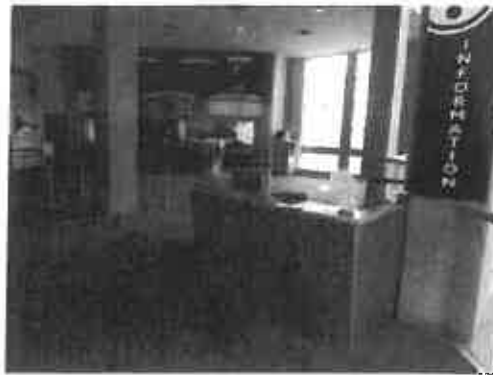
Figure 17 - Information Counter has no Lowered Accessible Portion