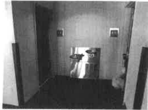
Figure 29 - Drinking Fountains Block Access to Restroom Doors at Upper Level Exhibits Area