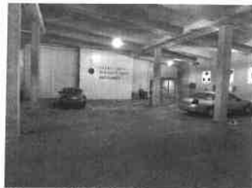
Figure 5 - Main Entry from Garage and Accessible Parking