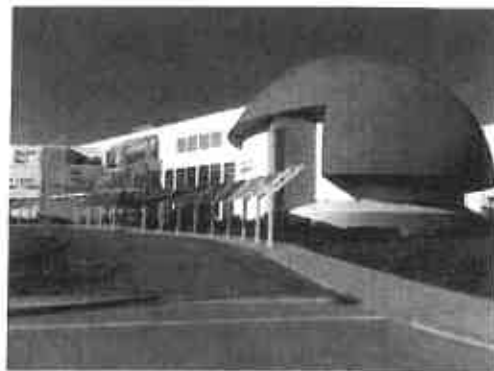
Figure 3 - Excessive Cross Slope along Route from Erieside Avenue