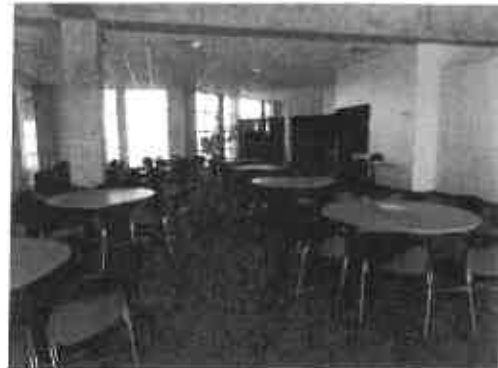
Figure 26 - No Accessible Tables in Brown Bag Lunch Area