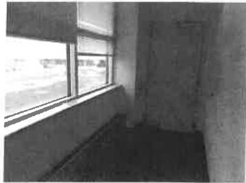
Figure 25 - Limited Maneuvering Space on Pull Side of Exit Door in Polymer Funhouse Area