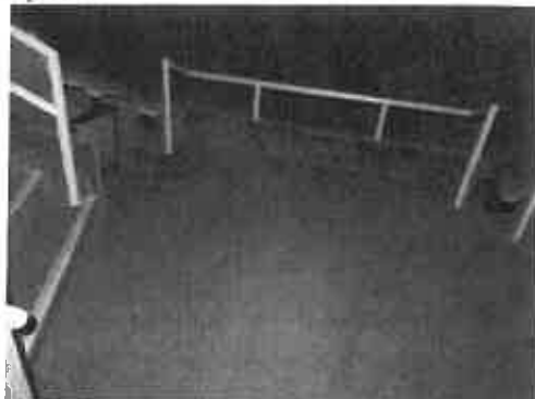
Figure 14 - Wheelchair Seating (Right Side) Area of Omnimax IMAX Theater has Posts and Stairs Encroaching