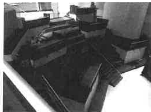
Figure 9 - Poor Sight Lines in Great Lakes Situation Room Auditorium

4. Great Lake Situation Room Auditorium - The wheelchair seating spaces on the floor at the front of this stadium style seating auditorium and two wheelchair spaces on a bridge at the street level are not integrated into the fixed seating plan and will not provide lines of sight comparable to those for all viewer areas as required by UFAS 4.33.3 (see Figure 9 ). The front wheelchair seating options offer great (even "front row") seating for lab demonstrations, but have very steep sight lines to the screen used for videos/films. The rear wheelchair seating options have sight lines limited by the positioning of the desk enclosures located below and between the demonstration table and these wheelchair locations. Additionally, there is no assisted listening system (UFAS 4.1.2(18)(b)) for this