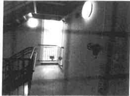
Figure 27 - Sprinkler Stand Pipe Valves are not Cane Detectable in Exit Stairs