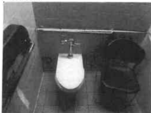
Figure 32 - Accessible Stall too Narrow (57-1/2") in Women's Main Level Exhibit Area