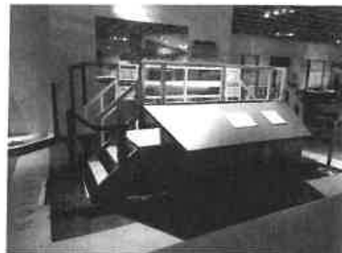
Figure 22 - Steps at Bridge of Fire Display Acceptable under Section 504 Fundamental Alteration Exception