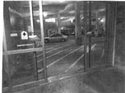
Figure 35 - Automatic Doors