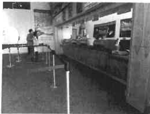
Figure 16 - Box Office Counter not Cane Detectable