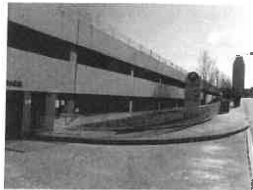
Figure 4 - Steep Approach and Limited Door Clearances