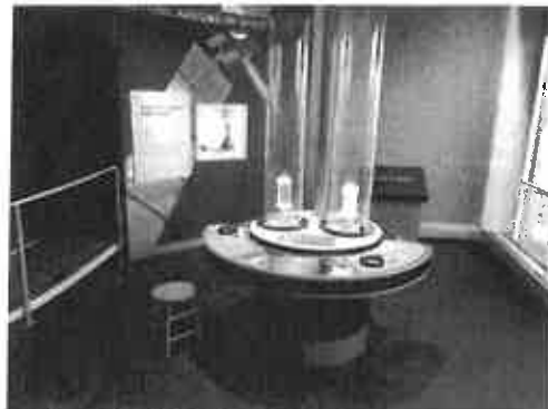
Figure 18 - Action/Reaction Counter not Cane Detectable in Glenn Visitor Center