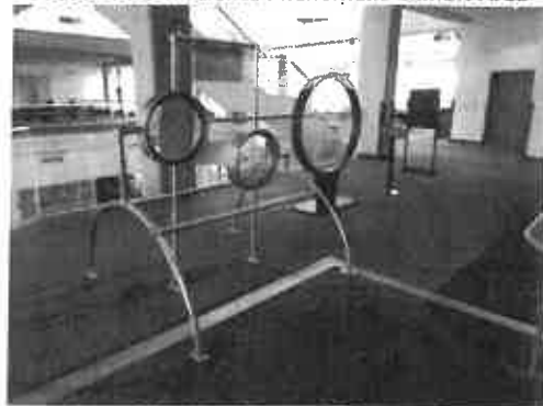
Figure 21 - Giant Lenses Display not Cane Detectable in Science Phenomena Exhibit Area