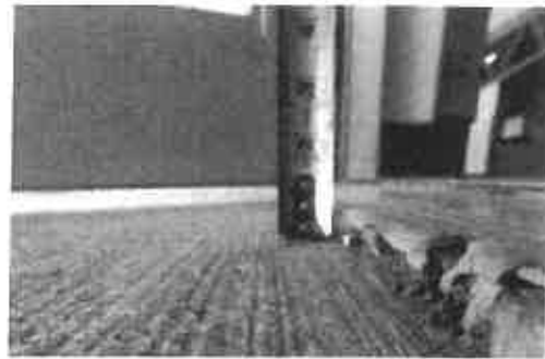
Figure 7 - Lower Level Lakeside Lobby Entrance Threshold Lip