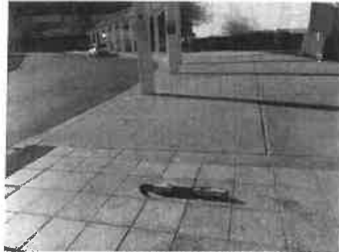
Figure 2 - Inaccessible Cross Slope from Accessible Parking to Front Entrance

Additionally, the concrete approach walk which extends from the back end of the designated accessible parallel parking space closest to the front entrance to the solar panel support post closest to the front entrance has an inaccessible cross slope exceeding (at up to 3.3%) the maximum 2% allowed under UFAS 4.3.7 (see Figure 2 ).