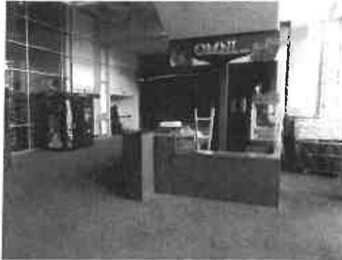
Figure 13 - Omnimax Concessions Counter Not Lowered at Cash Register